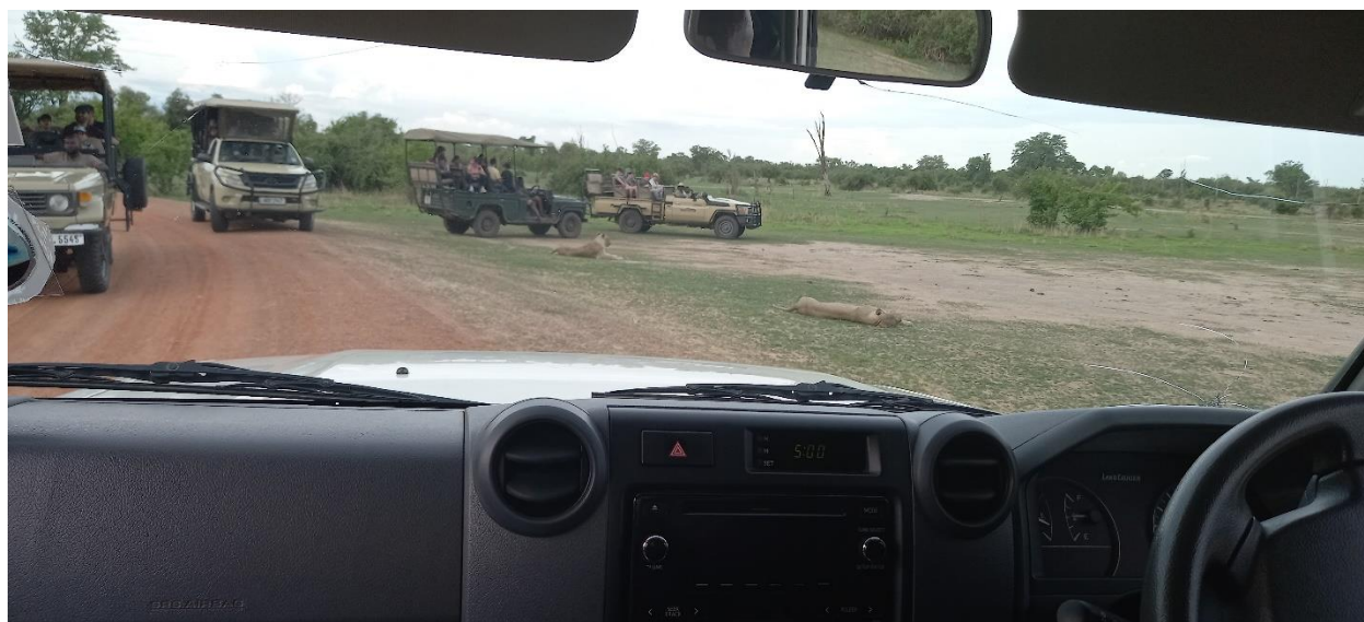
Open safaris at Luangwa National Park

Well worth a visit. There are relatively budget camps like Flat dogs and Wildlife, with camping, safari tents and chalets. It’s just a fantastic place to relax and enjoy the wildlife, swimming pool and drinks.