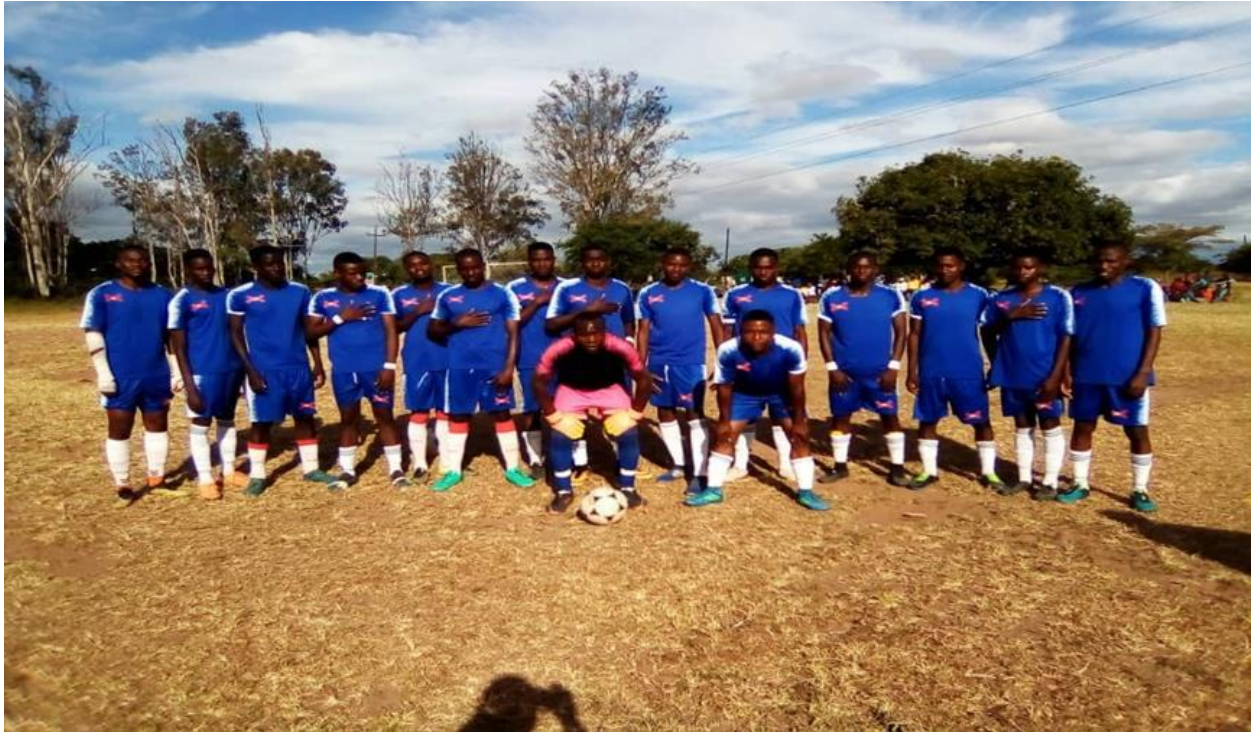
St. Francis Football Team