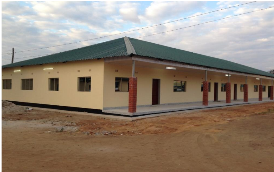
Physiotherapy building after