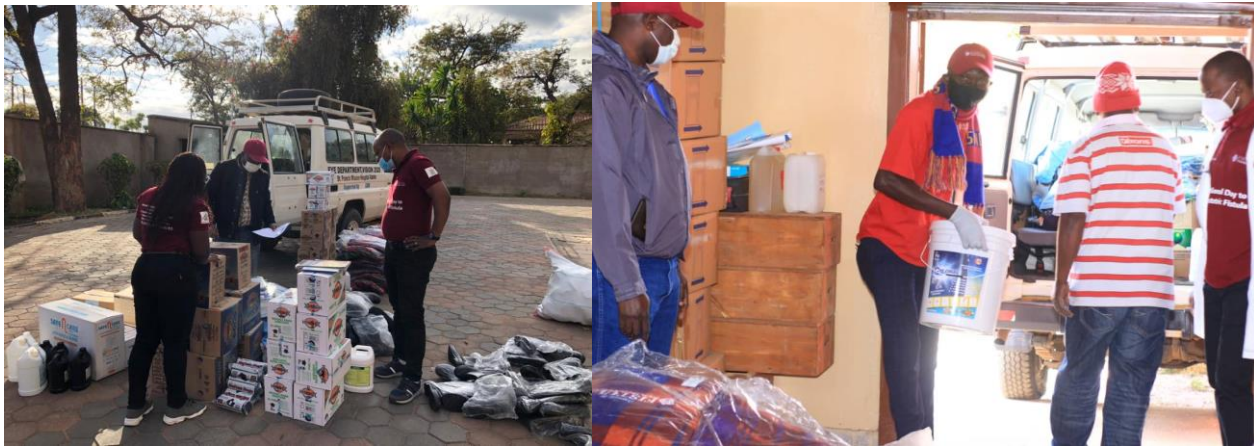
Above: The Senior Hospital Administrator receiving the donation of COVID 19 materials from Fistula Foundation Zambia.