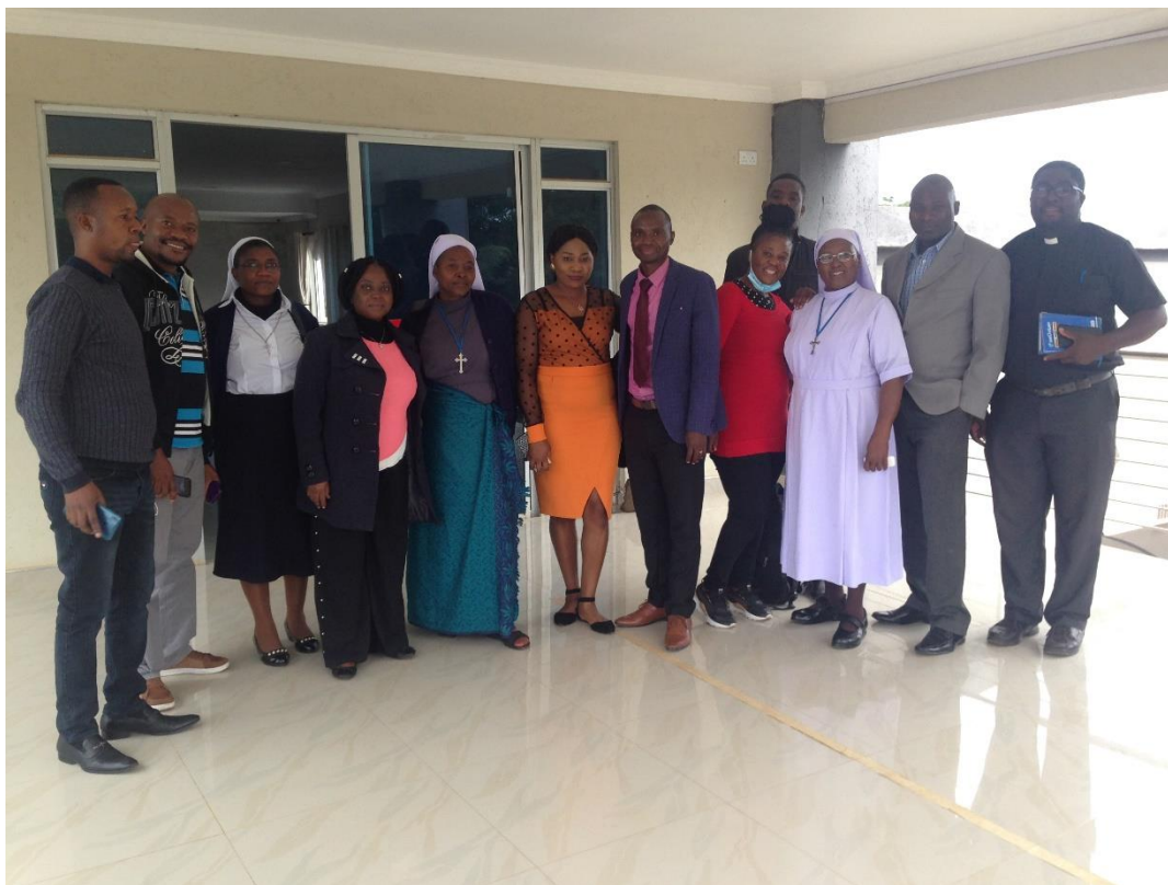
Participants pose for the photo after two day's training for Administrators, Program Officers and Accountants drawn from the Churches Health Institutions in Eastern Province. The training was held in Petauke from 3rd to 4th May, 2021 and was supported by CHAZ in order to prepare CHIs to implement the new HIV/TB grant.