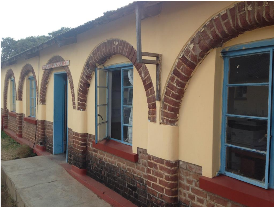
Physiotherapy building before

The paving around the building is currently in progress before the project can finally be handed over.