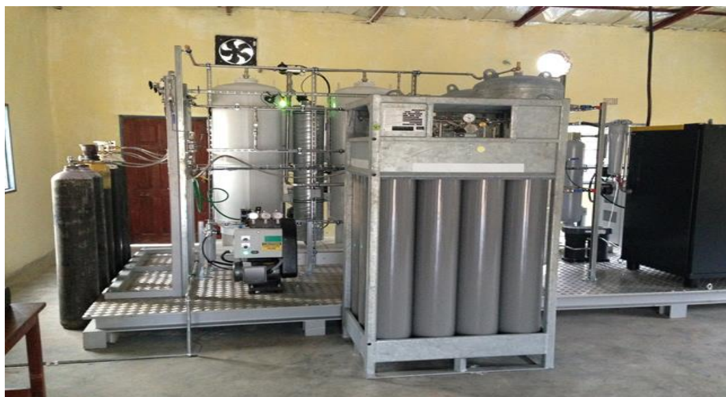
Oxygen plant in operation