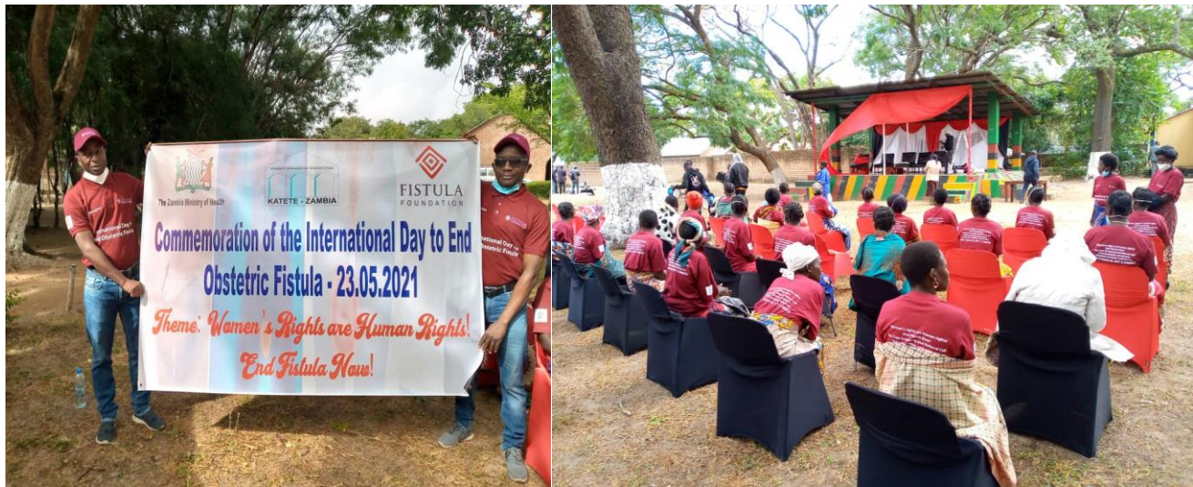
Below: St. Francis Hospital hosted the world in commemorating the International Day to End Obstetric Fistula on 23 rd May,2021