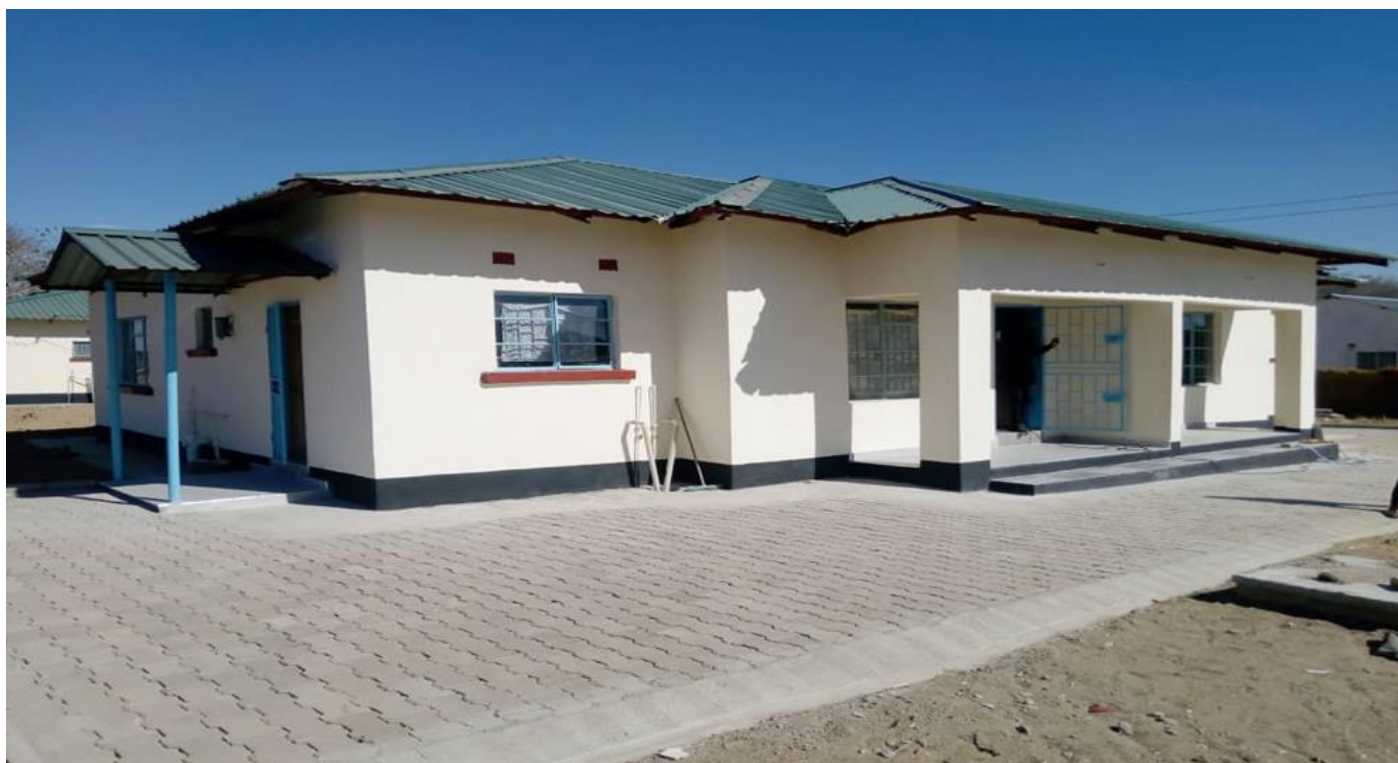
Newly completed intern- doctor's flats built with support from Beit Trust