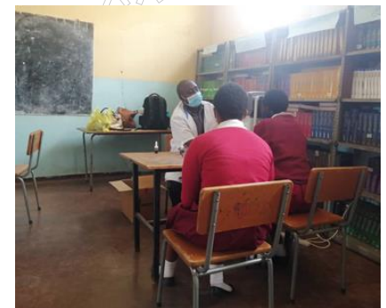
Eye screening during the school eye outreach