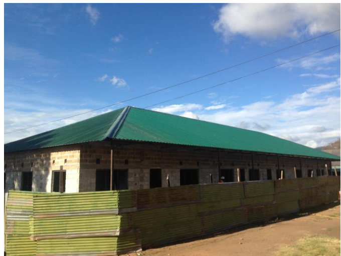
The physiotherapy building under construction

The major works on the oxygen plant housing which includes the installation of electrical and plumbing fittings have been done. The Muslim Association in Katete and Chipata Districts building donated materials worth K40,000.00 towards the completion of the building.