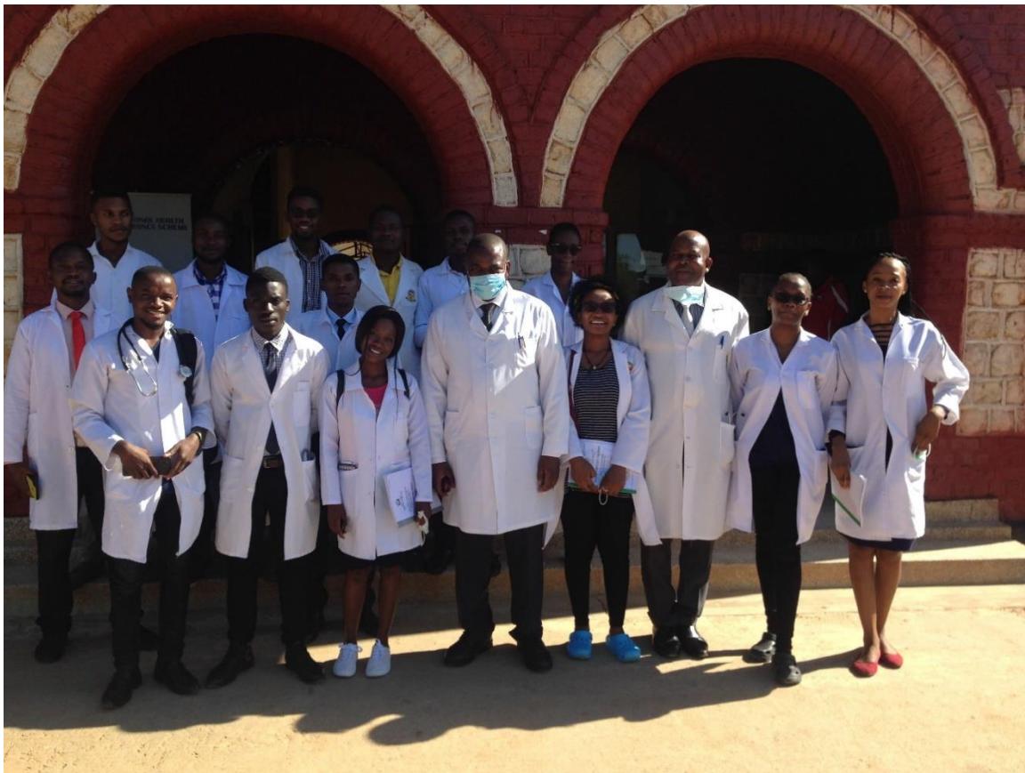
Clinical Officers students from Chreso University and Lusaka Institute of Applied Sciences bidding farewell after 8 months of clinical attachment