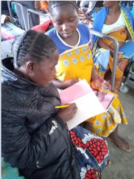
Mothers during lessons