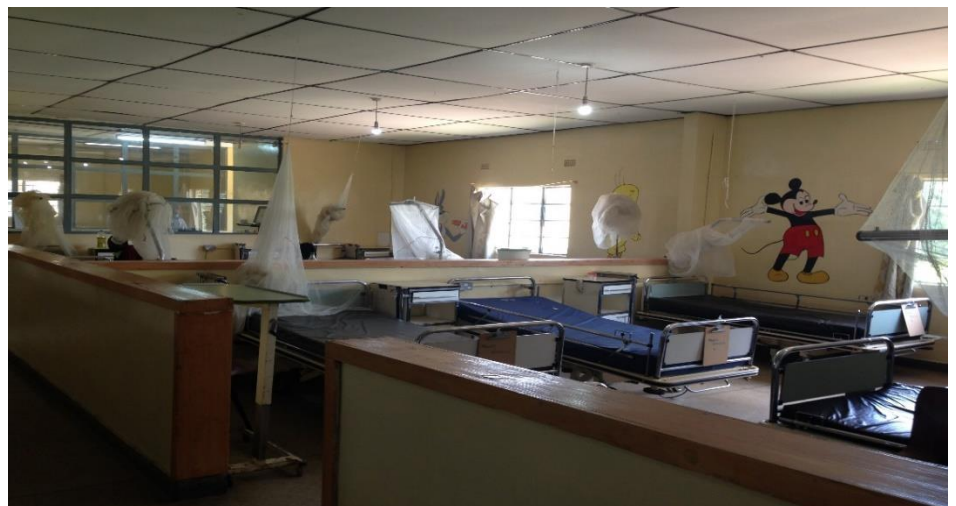
Re-decorated pediatric ward

In 2019, the hospital received some funds from the Logie legacy to procure the cardiac probe. The numbers of suppliers have been contacted to supply the probe over one year without success. Finally, we were able to get a supplier who responded to the supply of a probe meeting our specifications and finally the probe was delivered and is functioning well. This will increase the profile of investigations that the radiology department is able to perform and ultimately improve the delivery of health services rendered to the patients.