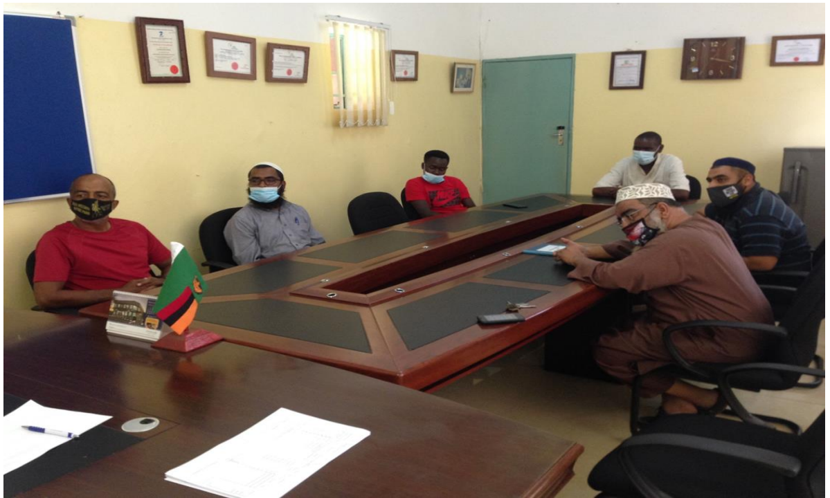
Leaders of the Muslim Association paying a courtesy call on the Medical Superintendent during the donations of building materials for the Oxygen plant