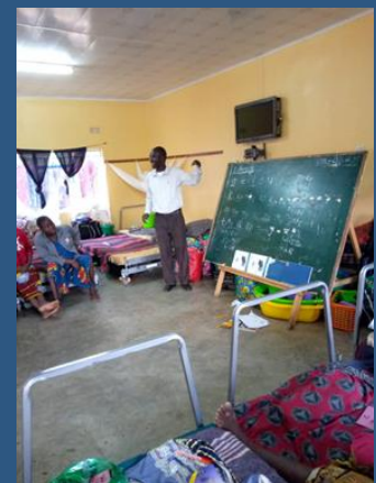
A teacher giving lessons to mothers.

Pregnant women who are at risk of developing maternal complications during delivery are admitted to the waiting shelter for close monitoring. The women come from all the corners of the Province. They are often referred to as "waiters". Some of these mothers have never been to school while others dropped out of school either at primary or secondary level. Most of them especially the young ones are willing to go back to school after they deliver.