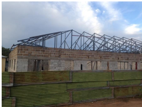
Physiotherapy building under construction

Barely two months of construction, the physiotherapy building is taking shape. The project which is being supported by the Medical Support Group of Netherlands and the Wilde Geetze will house the Physiotherapy unit, a Gym, Medical Records and Pharmacy Central Stores.