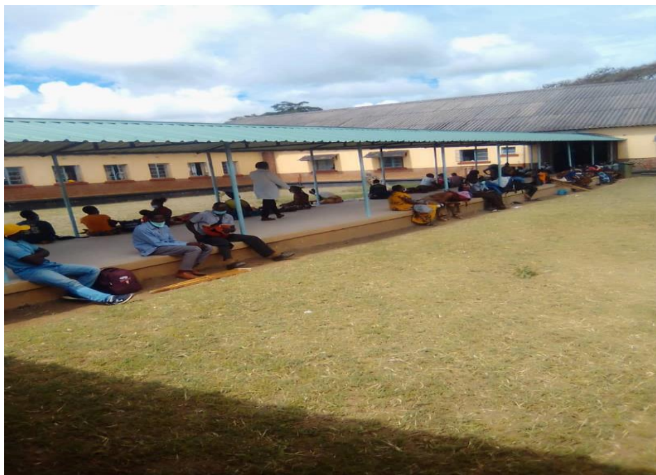
Patients waiting to be attended to by the Orthopedic surgeon

Thankful to Flyspeck and the Fistula Foundation for changing the lives of our people.