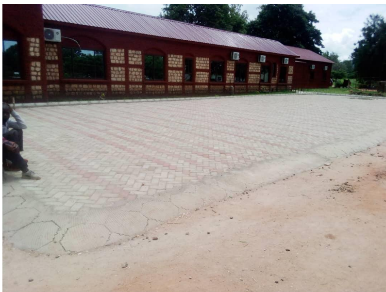
New car park at pharmacy block

The paving outside the Pharmacy block concluded the renovation of the Pharmacy which was supported by MSG. The renovation was made possible from the saving from the project and we are grateful to MSG for this consideration. The paved area has not only added beauty to the hospital but has also provided an ideal parking area.